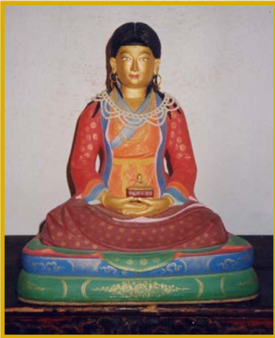
The Wisdom Dakini Sera Khandro