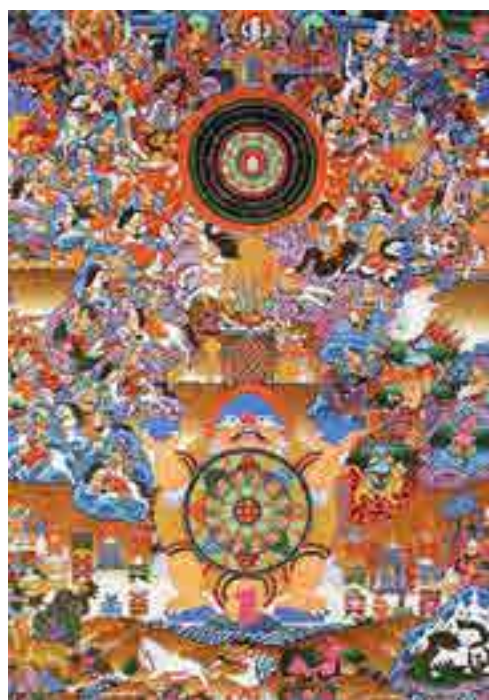
Astrological Diagram of Tibetan Buddhists

There are no obvious distinction between the fourth stage and the fifth stage of death, especially when a dying person enters into the fourth stage whose body has stopped its responses to outer stimulations. Thus when the dying person has entered into these stages, the living people have no way to know the mental conditions of the deceased one from the changes of his/her physical body.