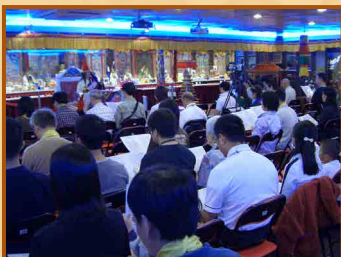
The Premise of the Dudjom Buddhist Association