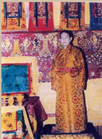
His Holiness Dudjom Rinpoche at Samye Monastery in Lhasa, Tibet.