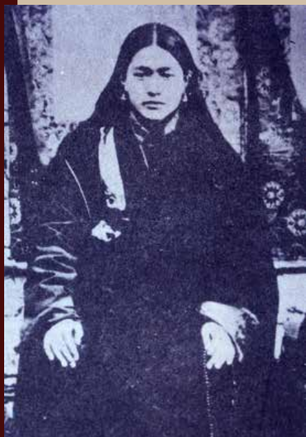
His Holiness Dudjom Rinpoche at His Youth (2)