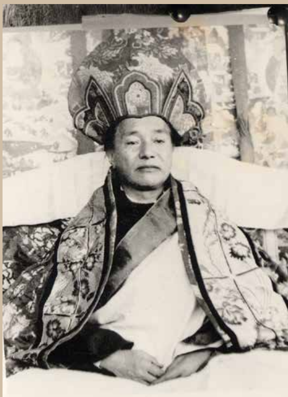
His Holiness Dudjom Rinpoche