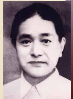
H.H. Dudjom Rinpoche at His Youth (1)