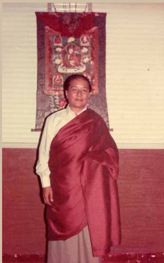
His Holiness Dudjom Rinpoche (1972)

He studied for sixteen years with Za-Pokhung Tulku Gyurme Ngedon Wangpo and had great realizations on the teachings of Dzogpa Chenpo. From Jamyang Khyentse Chokyi Lodro, he received the tantric teachings (Gyud, Lung, and Men-Ngag) of the " Sangwa Nyingthig ". He further received Dzogchen teachings from Jedrung Thinley Jampai Jungne (Dudjom Namkhai Dorje) of Riwoche.