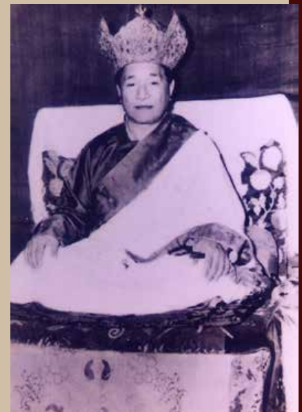
His Holiness Dudjom Rinpoche

His Holiness Dudjom Rinpoche was world famous as a very prolific author and a scholar. His writings are celebrated for the encyclopaedic knowledge they display of all the traditional branches of Buddhist learning, including poetics, history, medicine, astrology and philosophy. A writer of inspirational poetry of compelling beauty, His Holiness had a special genius for expressing the meaning and realization of Dzogpa Chenpo with a crystal-like lucidity.